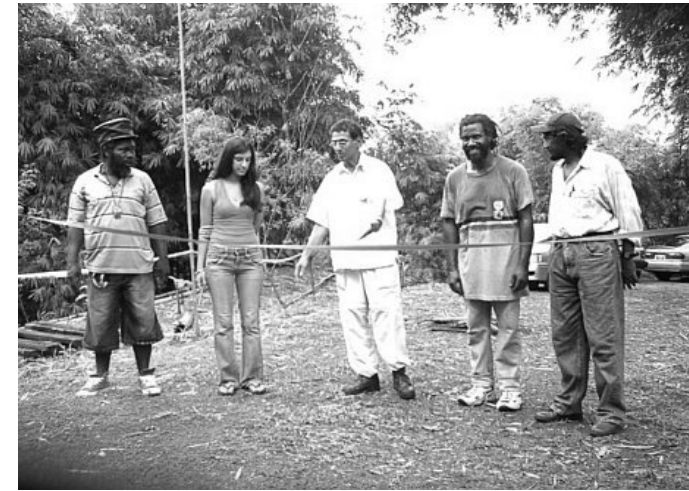
Project Opening Ribbon Cutting Ceromony

TRINIDAD AND TOBAGO RASTAFARI UNITED EDUCATIONAL DEVELOPMENT PROJECT TRINIDAD, WEST INDIES