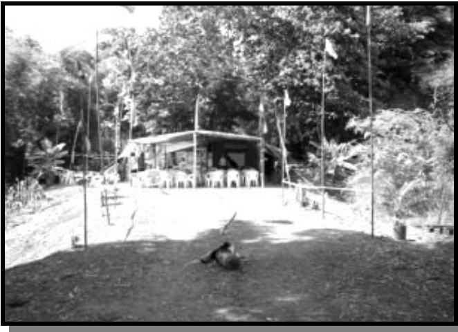
TTRU TEMPORARY STRUCTURE , FYZABAD, TRINIDAD