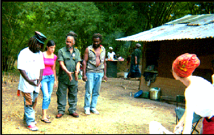
TTRU members stand for photo