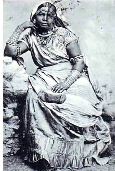
Dalit Dravidian woman from South India