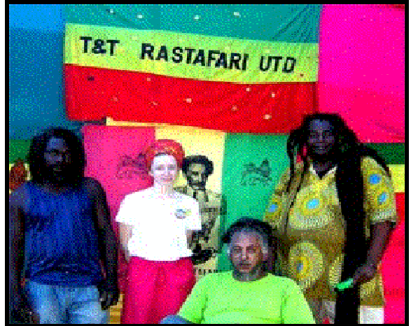
TTRU members in Trinidad