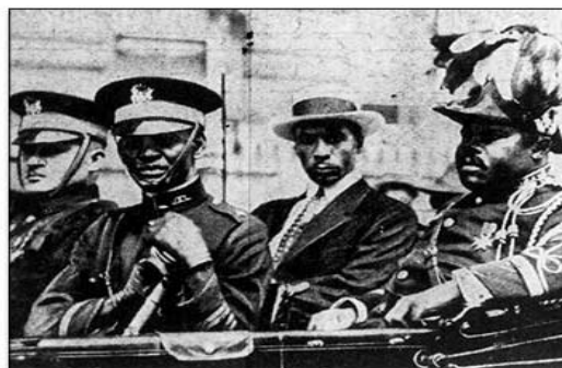
THE MARCUS GARVEY AND UNIA PAPERS PROJECT