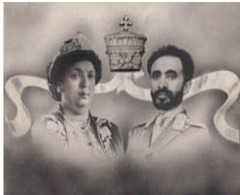
Their Imperial Majesties. Emperor Haile Selassie I & Empress Menen I.