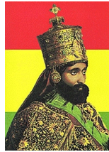
Haile Selassie I